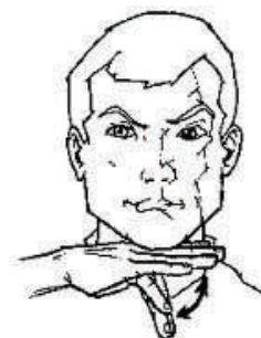
Sign for Pig

In Sign Language the children will learn a variety of signs during group time. One of my main goals is that they develop an understanding of what it means to be deaf and that they realize that being deaf makes you no different other than you communicate with the visual language of Sign Language. They'll experience the beauty of the language as we read stories in sign, play games and sing songs in sign. Each month we practice the signs for a different topic as well as review the signs that we've already learned.