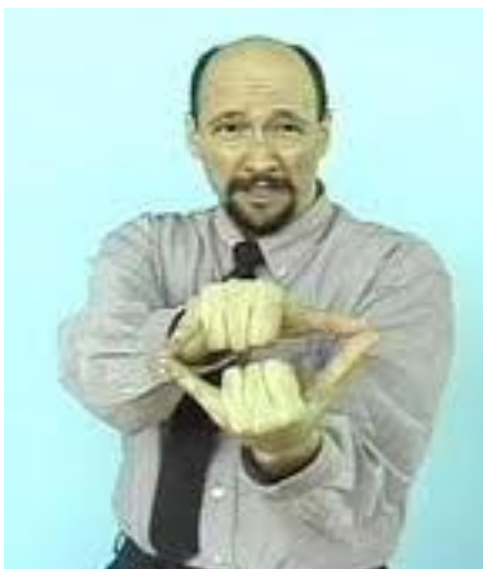
American Sign language for "hippo"